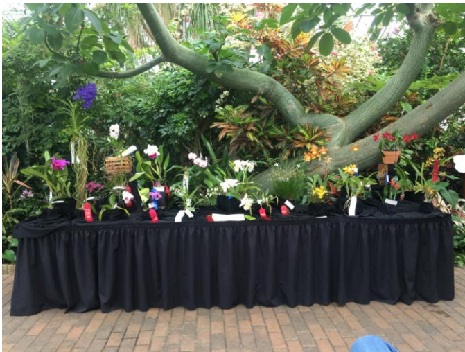
KOS display Indianapolis Orchid Show, April 2019