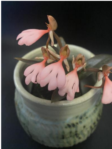
Habenaria rhodocheila