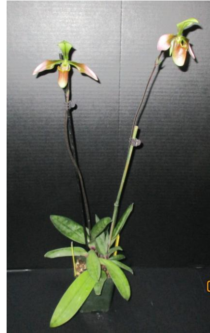
Paph. appletonianum Anne-Marie Blancquaer