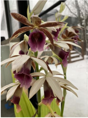
Phaius tankervilleae