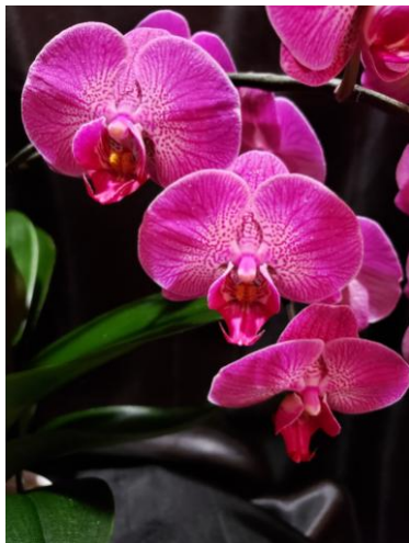
Phal. Unknown - Pink Jim Lardner

Visit us at our website www.kyorchidsociety.com or on Facebook at Kentucky Orchid Society