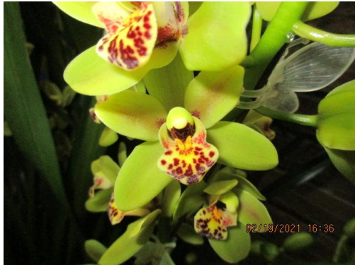
Cym Mad Irishman