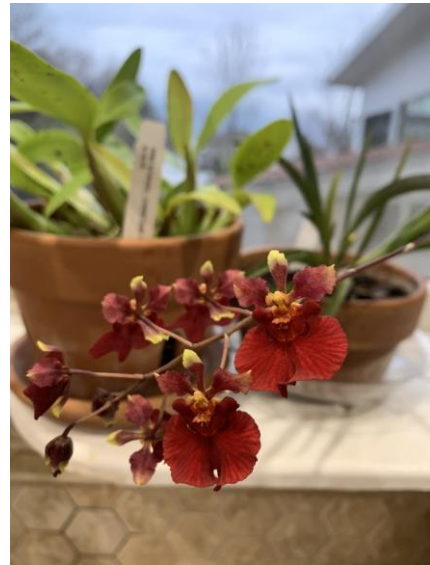
Tolumnia Jairal Flyer MO 01 Tetyana Schroeder