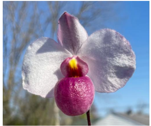
Paph. delenatii var. Dunkel (display) Pam LaRocco