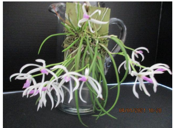
Leptotes bicolor Anne-Marie Blancquaert