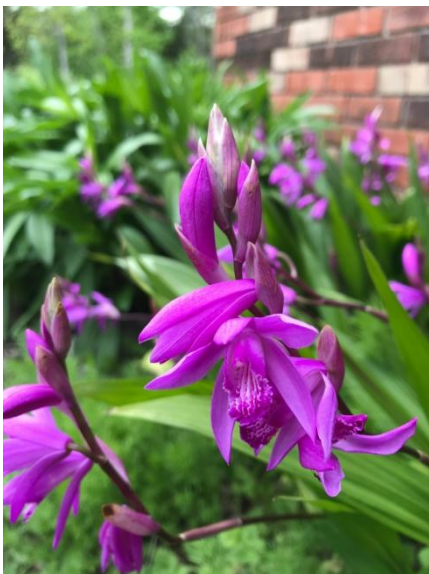
Bletilla striata