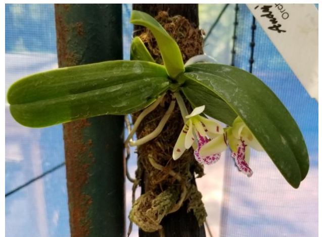
Sedirea japonica