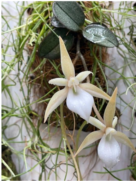
aerangis [Aergs.] punctata Stu Fleishaker