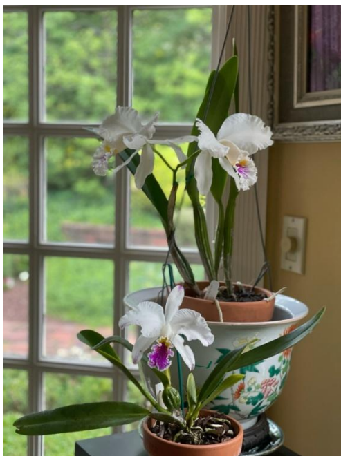
C. mossiae blanca x aurora and C. mossiae s/a pincelada 'Valerio x C. mossiae Llamarda (display) Carla Cates