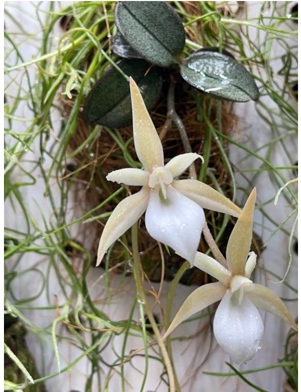
Aer. Punctata