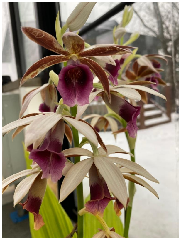
Phaius tankervilleae