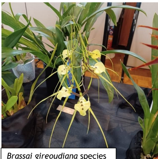
Brassai gireoudiana species