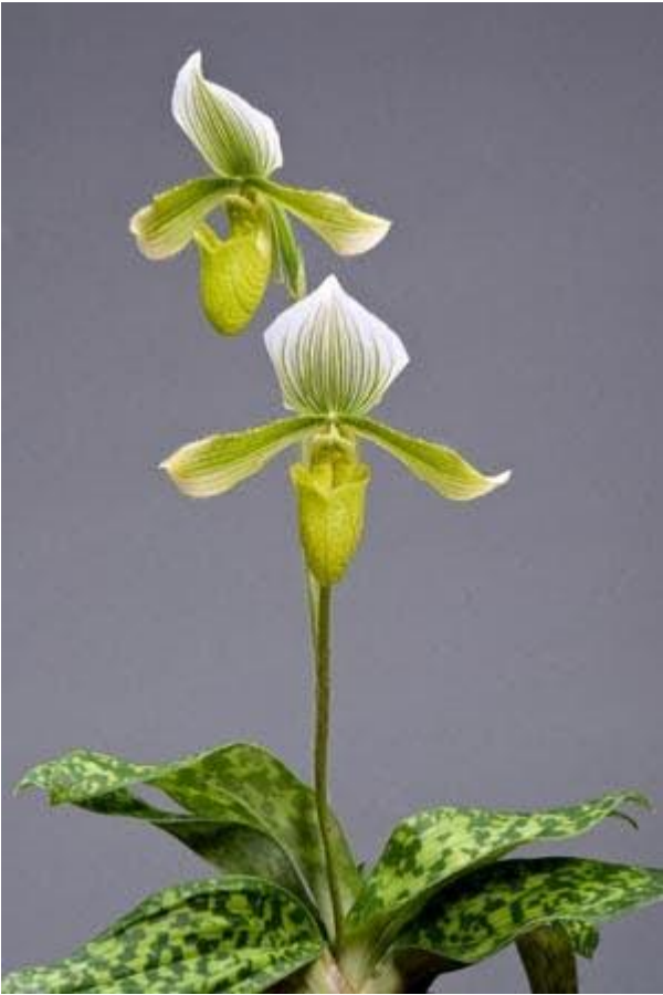
Paphiopedilum Maudiae types may need staking for best presentation