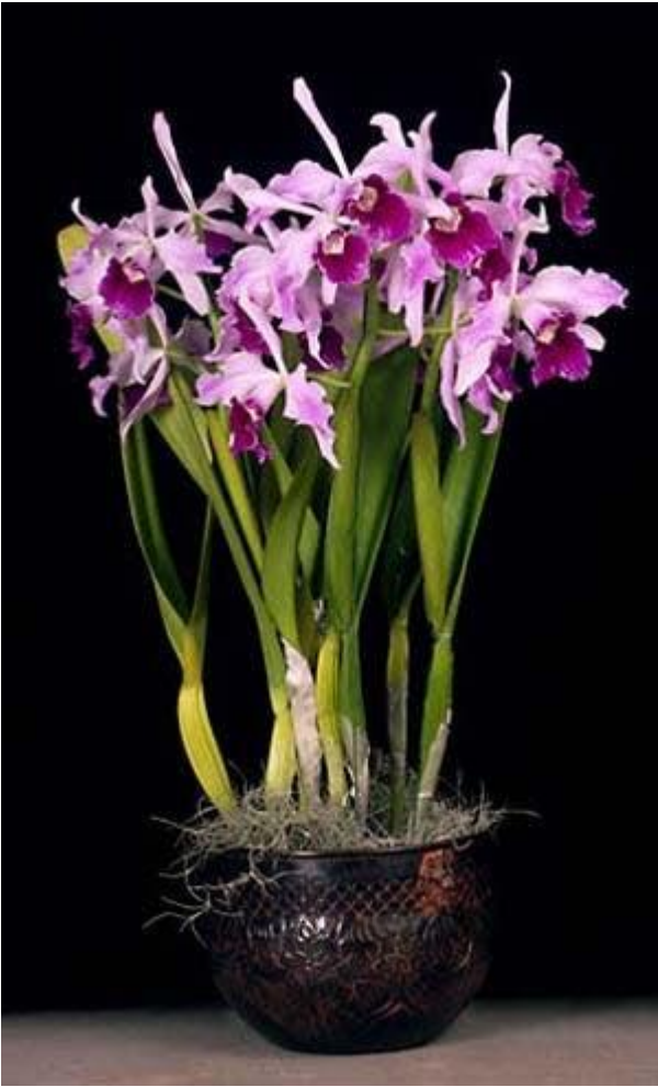
Cattleya purpurata , formerly in the genus Laelia , is without a doubt one of the most stately orchids to bloom in this season.